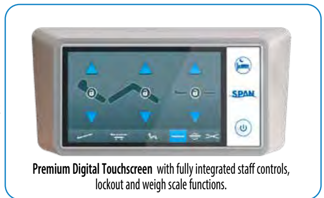
Premium Digital Touchscreen with fully integrated staff controls, lockout and weigh scale functions.