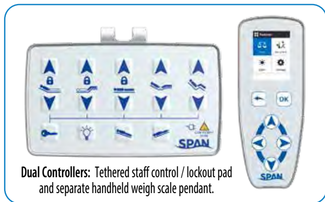
Dual Controllers: Tethered staff control / lockout pad and separate handheld weigh scale pendant.

Now available with choice of two weigh scale package options: