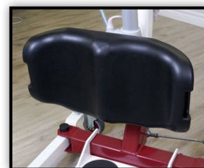
Contoured knee pad with 3 height settings