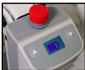
LCD battery level display; audible low-battery indicator