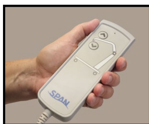
2-button pendant with LED indicator