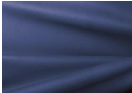
LifeSpan™: coating remains intact