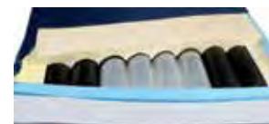
Therapy in Center

When ordering, customer must specify if the dynamic air therapy should be positioned in the Center of the mattress (for single user), or on the Patient's Right Side (for two users or a single user who cannot/prefers not to move to the center of the mattress). Note: "Patient Right" is with patient in a backlying position.