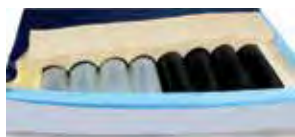
Therapy on Patient Right

When ordering, customer must specify if the dynamic air therapy should be positioned in the Center of the mattress (for single user), or on the Patient's Right Side (for two users or a single user who cannot/prefers not to move to the center of the mattress). Note: "Patient Right" is with patient in a backlying position.