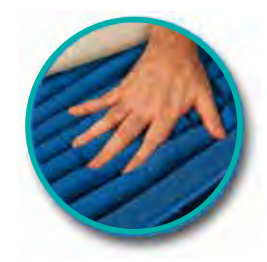
Durable, consistent performance High resiliency UHP 500™ foam layer provides a 55% higher Support Factor than typical medical grade foams.