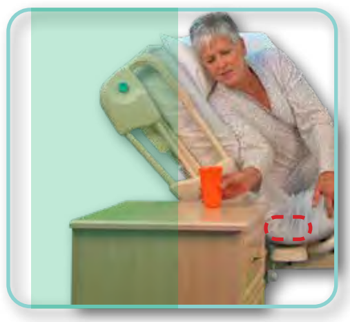
Ordinary fixed deck bed : the seat deck does not move during HOB elevation, forcing user out of vertical alignment.