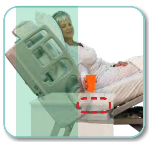
Encore : seat deck retracts during HOB elevation maintaining the user in a safer comfortable zone of vertical alignment (shaded green).