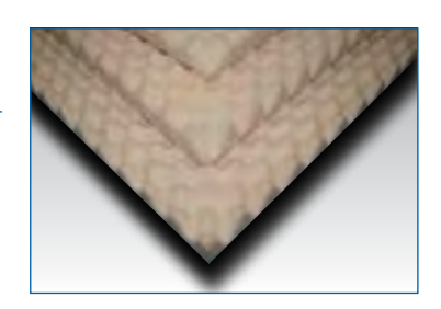
Made from high-quality, combustion modified polyurethane foam. Specifications vary to address any level of surface discomfort. All pads are 72"L x 34"W, and are compression rolled for efficient storage.