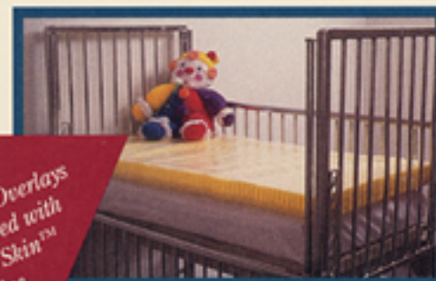
▼ Delta Pediatric Crib Overlay (#0204)

Children's skin is more tender and susceptible to breakdown if optimum pressures are not provided. Nurses often have to improvise with towels, water-filled latex gloves and other "home-made" products to provide proper skin care to children in pediatric units. Delta Pediatric surfaces provide low interface pressures and maximum comfort to children in need. They are safe, non-toxic, heat-resistant and comfortable.