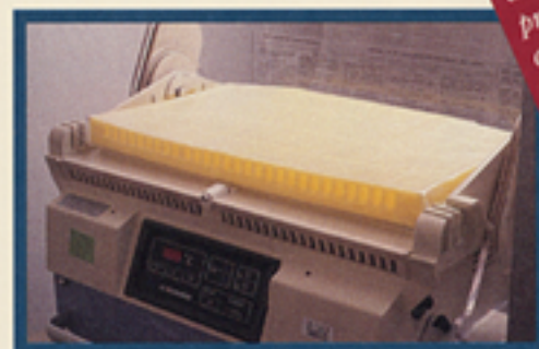
▼ Delta Neo-Natal Isolette Overlay (#0200)

Children's skin is more tender and susceptible to breakdown if optimum pressures are not provided. Nurses often have to improvise with towels, water-filled latex gloves and other "home-made" products to provide proper skin care to children in pediatric units. Delta Pediatric surfaces provide low interface pressures and maximum comfort to children in need. They are safe, non-toxic, heat-resistant and comfortable.