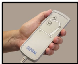
2-button pendant with LED indicator.