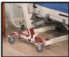
Underbed clearance allows use with most low beds.