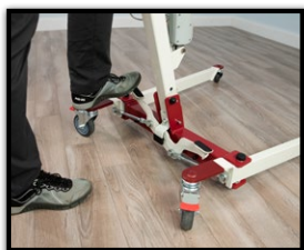
Foot pedal base width adjustment.