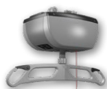
Fixed and portable lithium-ion overhead lifts