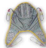
Re-usable and disposable specialty slings

SPAN better science. better care. www.spanamerica.com