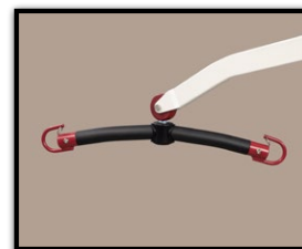
2-point spreader bar accommodates a variety of sling options.