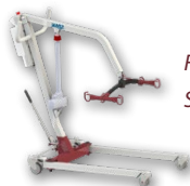
Full body and Sit-to-Stand floor lifts